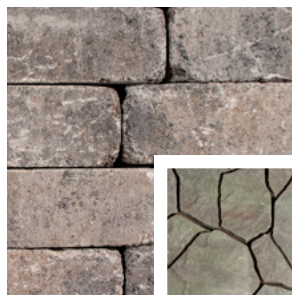
COTSWOLD MIST W/ BROOKSTONE SLATE ACCENT