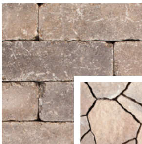
GASCONY TAN W/ ASHBURY HAZE ACCENT