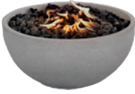
A. Fire bowl