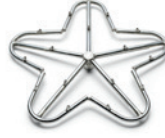
B. Gas insert